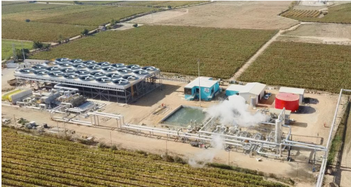
OME T-01 geothermal power plant in Alasehir OME_T-01