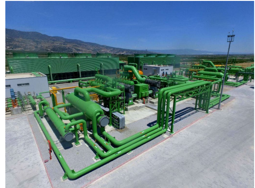
Greeneco Energy geothermal power plant in Sarayköy GreenECO_GPP-7.jpg